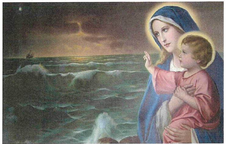
SEA SUNDAY 2024 – Our Lady Star of the Sea – Image by Xandar - own work, Public Domain