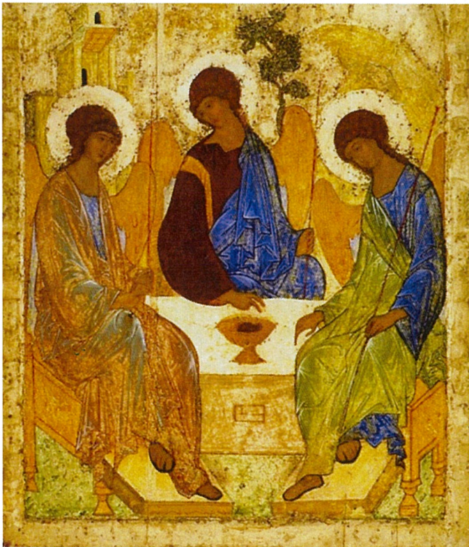
The Trinity (Russian: Троица) – Andrei Rublev, 15th century