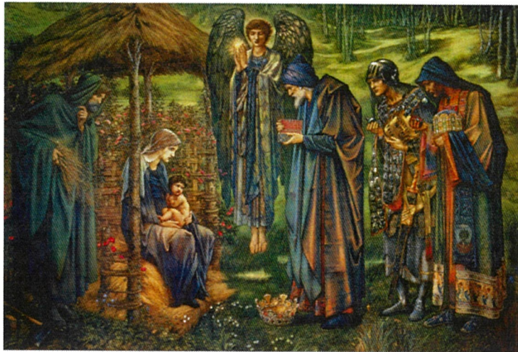
The Star of Bethlehem – Watercolour & gouache painting made in 1890 by Edward Burne-Jones, 1833–1898 Height: 101.1 cm; width: 152 cm. The Birmingham Museum & Art Gallery. Work in the Public Domain.

HOLY TRINITY PARISH | SUNDAY 8 TH JANUARY 2023