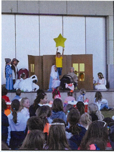
Our Lady Star of the Sea School Concert 2022: