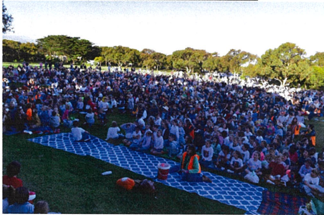
St Aloysius School Concert 2022: