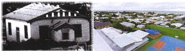
Then and now!

Exciting News from St Aloysius: Term 2 is shaping up to be a very exciting term with many events and activities for both students and families in the planning. Our biggest milestone will be the celebration of our 120th Anniversary as a school in June. We have a big day of celebrations planned for 24th June which is the last day of term 2 to mark this very special occasion including a dress up day in period (1902) costume, a display of archive material and a morning tea for past and present students and families. If you know anyone who attended St Aloysius over the past 120 years, or you would like to be involved in the Steering Committee we are forming to plan the celebrations, please contact Ms Miriam Leahy on mleahy@saqueenscliff.catholic.edu.au