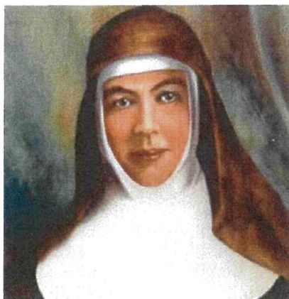
St Mary of the Cross MacKillop, pray for us.

Please send in bulletin notices by Thursday